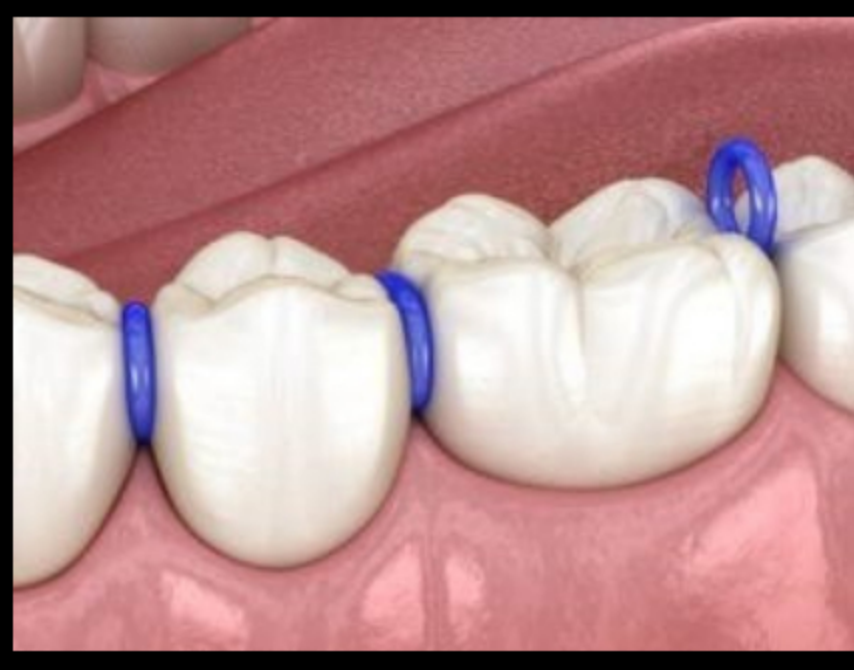
Separators (aka "spacers")